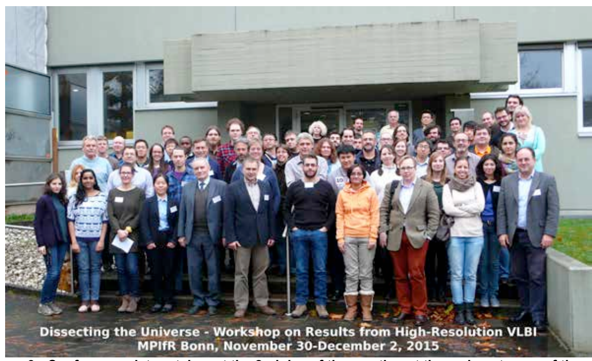
Figure 3 - Conference picture taken at the 2nd day of the meeting at the main entrance of the Max-Planck-Institut für Radioastronomie

The conference picture is provided in Figure 3.